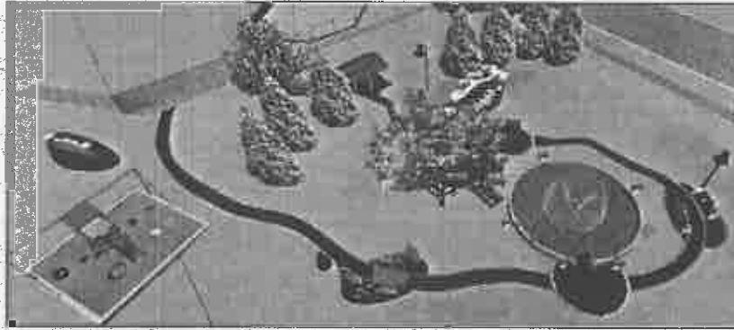
Josh Iben with 151 Landscape put this illustration together to show the proposed two-phase concept for Fountain Park in Monticello. Phase one would restore the fountain to working order at $52,000. Phase two involves aesthetic features at $43,000. (Illustration submitted)

"Even if we have $20,000, that still gets some things done," Herman said of aesthetics.