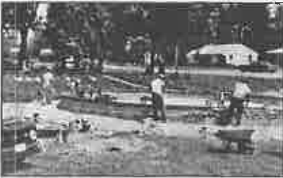
This photo of the current fountain being built appeared in the July 25, 1974 Express. Working on the project were Bader Masonry, Fred Iben, Al Iben, Staner's Plumbing, and KEM Electric.

The proposed new fountain would remain the same footprint of the current structure, just with a smaller pool of water. The pool of water would be filled with river rock for the fountain water to land on, and then circulate over and over as it sprays up and out.